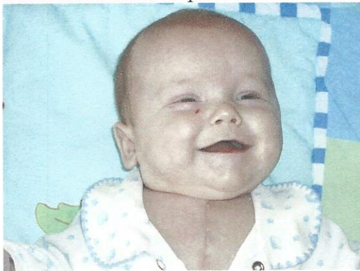
Here he is a week after surgery.