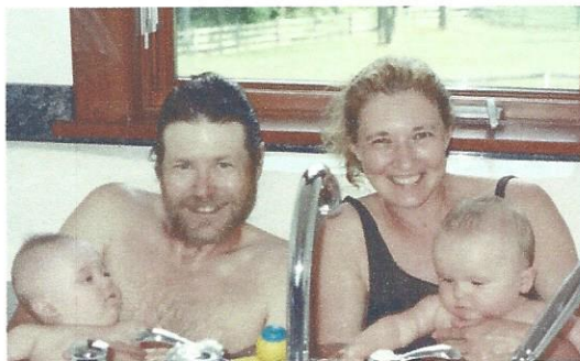
This is all of us in July.