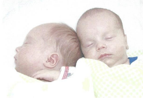
Together in the bassinet in January 2003