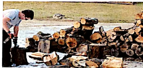
Aubrey splitting logs

On the contrary, with our two teenage boys, we are taking the opposite approach as much as possible. We “have” these two sons that we feed, shelter, and clothe, but other than requiring that they continue their violin studies until graduation, we are trying to get them to “keep” themselves as much as possible in terms of their schoolwork, activities and relationships. I like “having” teenage boys but every now and then my senses become overwhelmed and I must “keep” them again by recommending the virtues of cleanliness.