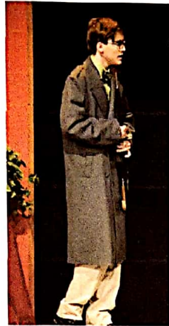
Beau as Prince Abdullah (Aladdin) and Mr. Green (Clue)

Having teenagers also requires learning a foreign language that we are forbidden actually to utter aloud.